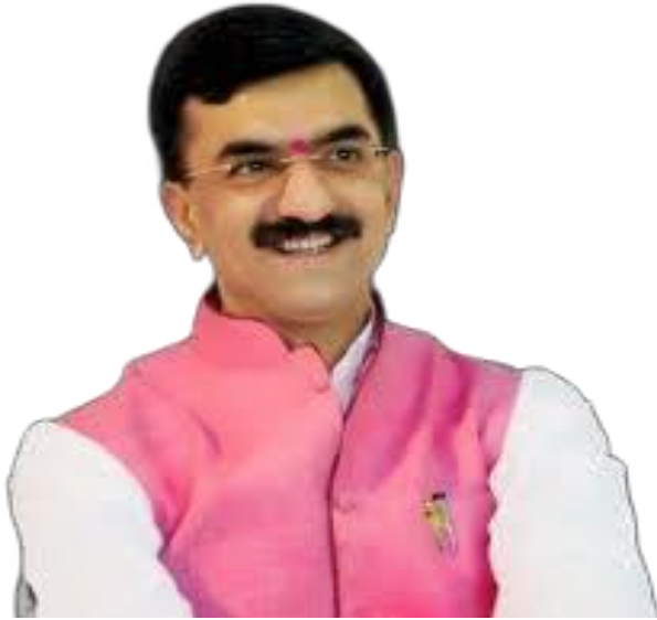
Sh. Shambhuraj Desai

Honourable Minister for Tourism, Mining and Ex Servicemen Welfare, Govt of Maharashtra.